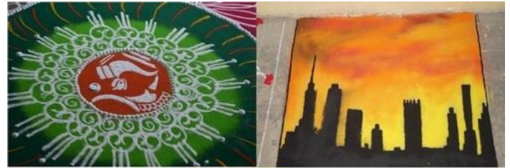
Rangoli Making Competition